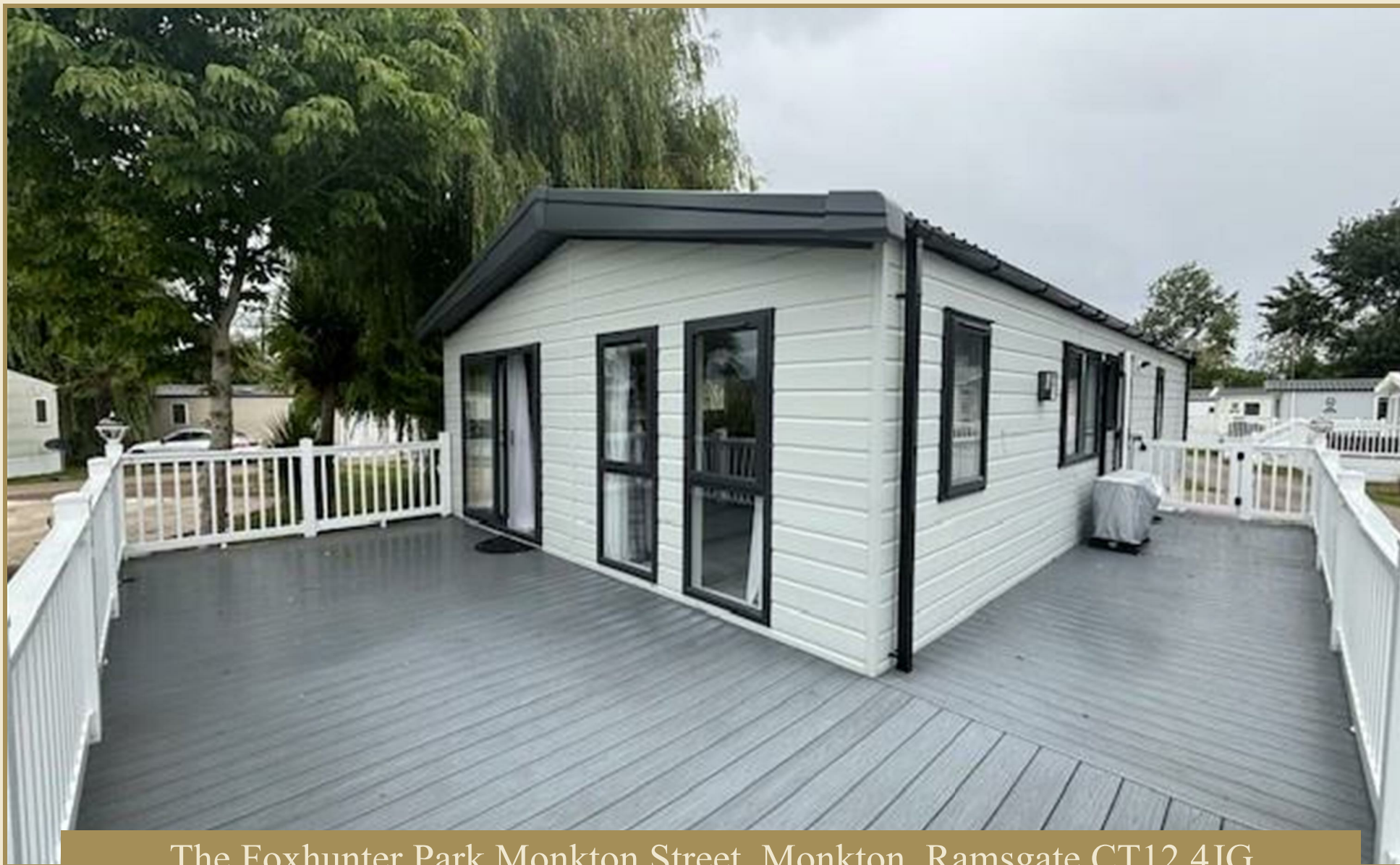
The Foxhunter Park Monkton Street, Monkton, Ramsgate CT12 4JG